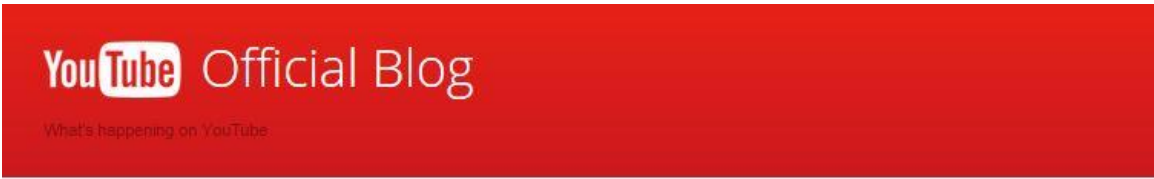
EXHIBIT A Launch of YouTube Kids on Official YouTube Blog